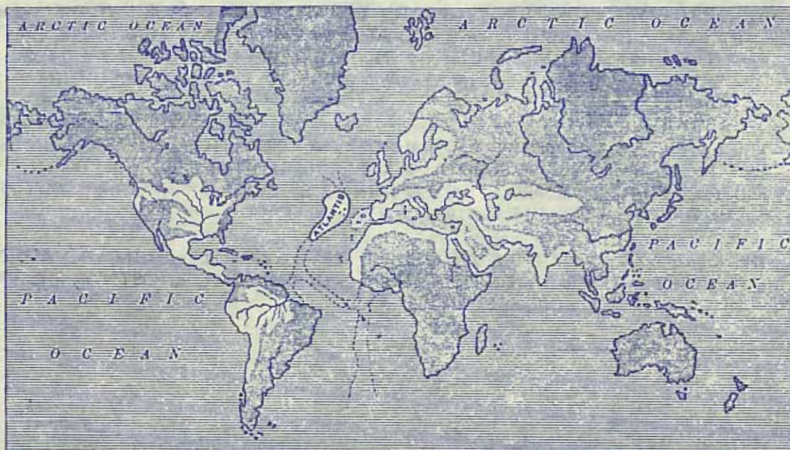
THE EMPIRE OF ATLANTIS.