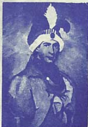
PIRATE CAPTAIN BILLY BOWLEGS

THE BILLY BOWLEGS' FESTIVAL HAS WILLIAM AUGUSTUS BOWLES, A NOTORIOUS OLD BOY, AS ITS PATRON PIRATE. HE ARRIVED IN WHAT WAS TO BECOME FLORIDA'S PLAYGROUND AREA IN 1778 WHEN THE SPANISH, ENGLISH AND AMERICANS WERE MANEUVERING FOR CONTROL OF THE GULF SHORES AND ITS SHIPPING LANES. BELIEVING HIMSELF DESTINED TO COMMAND INSTEAD OF OBEYING, CAPTAIN BILLY BOWLEGS GATHERED A FORCE OF A "COUPLE HUNDRED PLUNDERING INDIANS, RELICS FROM THE AMERICAN ARMY AND WHITE BANDITTI", A ROLICKING PIRATICAL CREW WHICH GREW TO BE THE CONCERN OF ALL THREE OF THE POWER-HUNGRY COUNTRIES. CAPTAIN BOWLEGS (BOWLES) CREATED HIS OWN THRONE AND THE THREE NATIONS CONSIDERED EVERYTHING FROM MURDER TO A GENERAL'S COMMISSION TO GET HIM ON THE RIGHT SIDE. FINANCED BY LOOT FROM A SPANISH SHIP AND SURROUNDED BY A HANDFUL OF INDIANS, CAPTAIN BILLY INVADED ENGLISH SOCIETY FOR SUPPORT. HE WAS REWARDED WITH A FLAG OF "ENGLISH AND INDIAN COLORS MIXED", A SILVER PIPE, TOMAHAWK, A CHAIN OF FRIENDSHIP AND TRADE SUPPLIES, WITH WHICH HE FORMED THE STATE OF MUSKOGEE. THE SPANISH ENTICED HIM TO NEW ORLEANS AND GRABBED THE HEAD OF THE STATE OF MUSKOGEE. HE WAS SHIPPED OUT TO MADRID, SPAIN, AND THEN TO THE PHILIPPINES, BUT HE JUMPED SHIP AND RETURNED TO HIS "STATE" AND GREATER DEEDS OF PIRACY. HE RAIDED ON THE GULF AND ON SHORE. HIS SCHOONERS FLEW HIS PIRATE FLAG, EXCEPT WHEN THEY SWITCHED TO THE BRITISH FLAG TO CLAIM THEIR "SALVAGED" LOOT AT INTERNATIONAL PORTS.