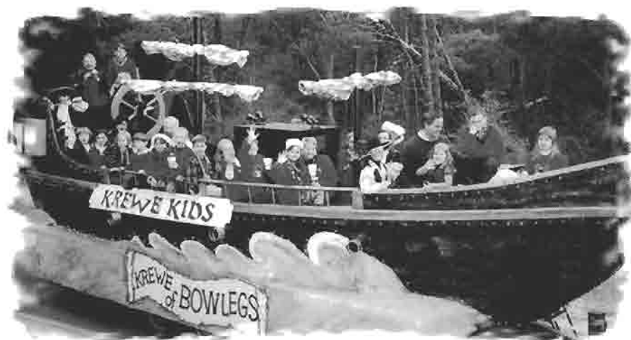
Children of the Court Christmas Parade