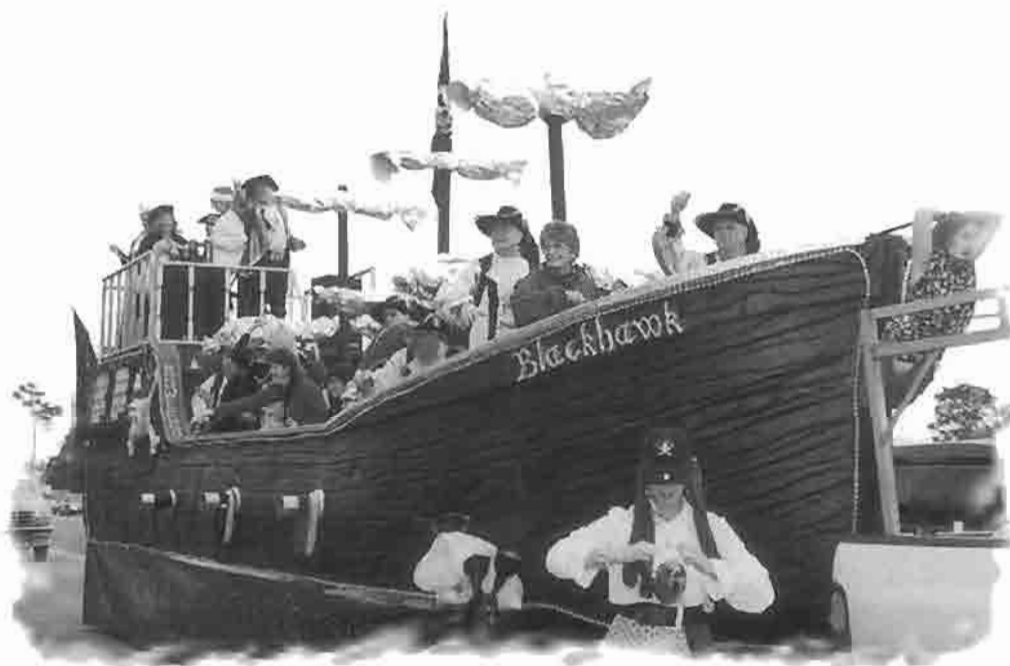
Parading on the Blackhawk