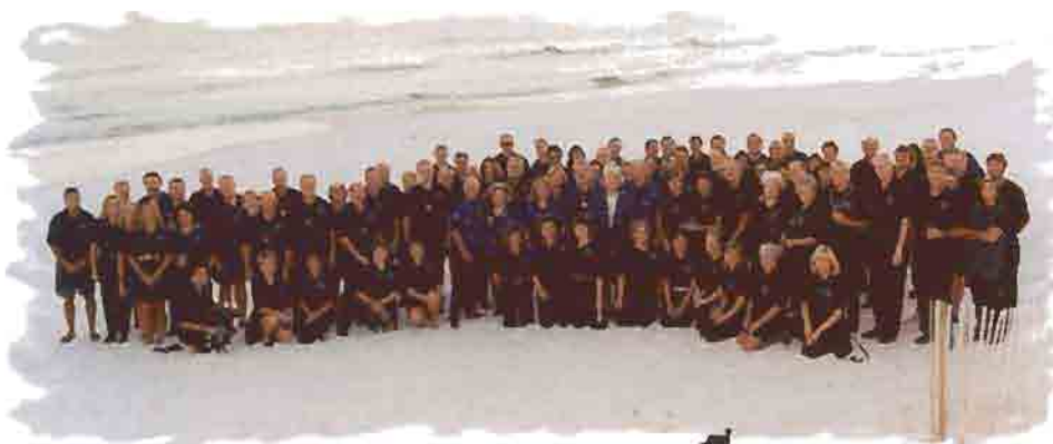
XLVI Top 6, Board, Honor Guard, Parents of the Children of the Court, and Parents of Princesses and Privateers