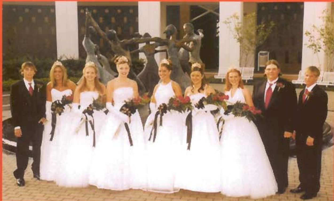
2003 - WLDJN - 2004