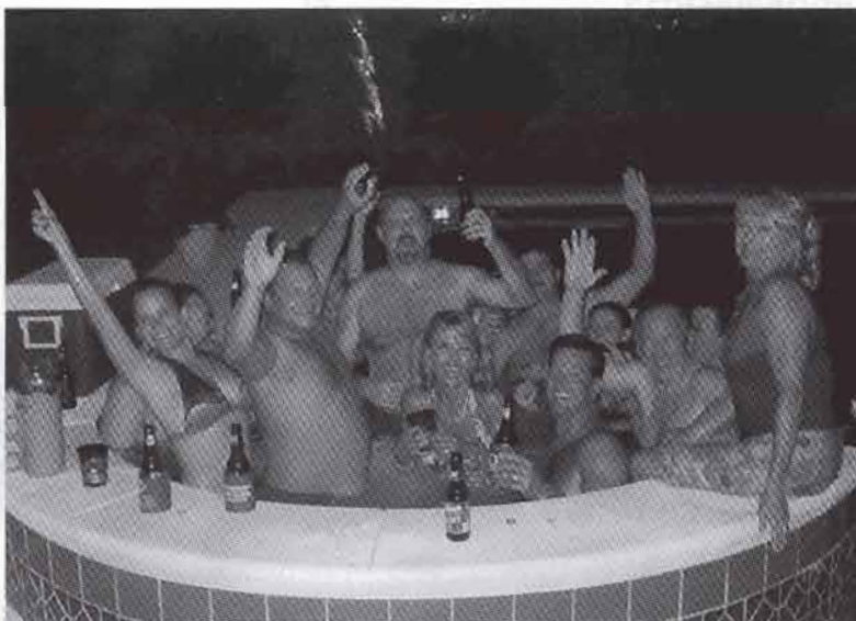
Honor Guard Gone Wild! - Picture Day - May 7th, 2003