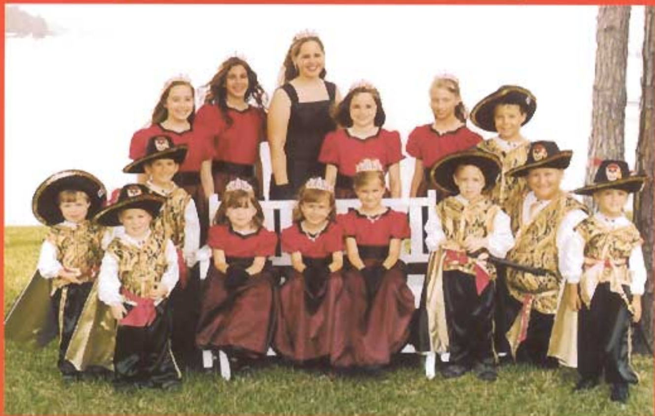
Children of the Court!!!